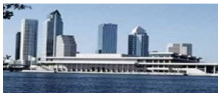
Florida West Coast Section Tampa

IEEE FWCS P. O. Box 2610 Valrico, FL 33595-2610